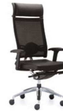
High back chair 高背椅