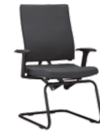
Mid back chair with cantilever base 中背椅弓字脚