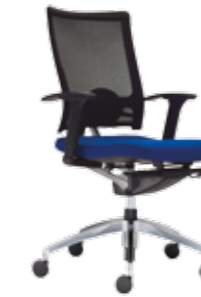
Mid back chair 中背椅